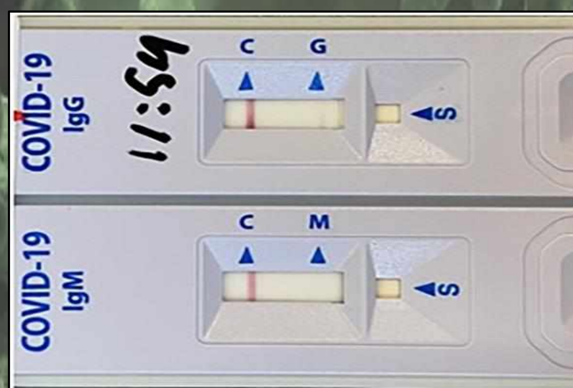
Figure 1: Rapid antibodies serological test (IgM/IgG) against SARS-CoV-2.

In spite of clinical findings, patient's evolution and recovery happen within a brief process (10 days) (Figure 2-d, e, f) than that described by former study. A 72 metabolites were classified based on m/z signals (features) ranked by -3.5 < \log_2(FC) > 3.5 and p\text{-value} < 0.001 . Additional investigation of metabolites' relationship was grounded on the correlation network diagram created by MetaboAnalyst 4.0 software using KEGG compound ID (Figure 3-a, b). Entirely, our outcomes suggest extensive lipid dysregulation with pronounced glycerol-, glycerophospho-, sterol lipids and fatty acids metabolism disturbance. Mediators of arachidonic and linoleic acids metabolism, which play a role on inflammation were found (Figure 3-a). Beside this, patient clinical amelioration was characterized with upper levels of free fatty acids, acylcarnitines and phosphatidylglycerols, as previously reported on serum metabolome of recovered SARS-CoV patients. Interesting that the metabolism of sterol- and glycerolipids is disarranged after clinical condition enhancement, particularly on respect to triacylglycerols and cholesterol esters (Figure 3-b). Macrophages activate pathogen recognition through Toll-like receptors, which stimulate early response through cytokine signaling to virus liberation and prolonged storage of fatty acids as triacylglycerols.